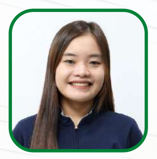
Teller Floridablanca Branch