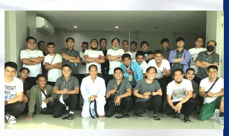
THE QUARTERLY RUNDOWN | PAGE 06